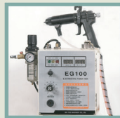
▪ Electrostatic Spray Gun